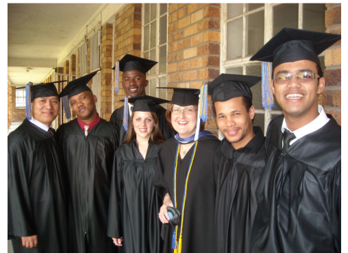
Me with some happy grads!